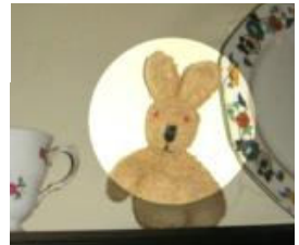
Magic makes a break for freedom but is spotted by the guards

The bunny was returned, but according to Shelagh is deeply traumatised. "It's just as if he's had all the stuffing knocked out of him," she reported.