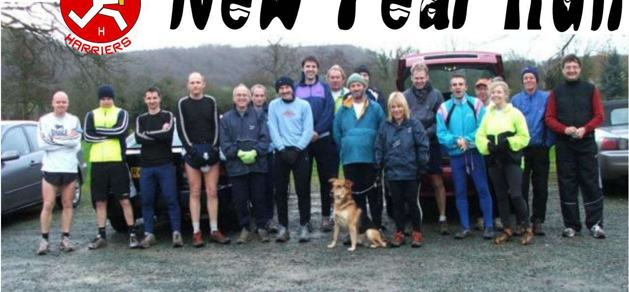
9:30am, Sunday 31st December 2006 at the Coppermine Inn, Broxton. Members and friends (19 + photographer) at the start of the traditional New Year Run.

In the celebrated traditions of the Run, despite the storms of the previous days the forecast was for a fine morning, and it was. The raw wind at the start gave way to pleasant conditions, except for on exposed hill edges where the breeze was chill. Those without studs or claws had problems at times as the previous week's rain had made the going rather greasy in places.