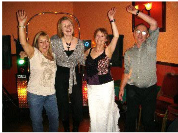
Jubilant harriers at the NSRRA Awards Presentation evening

of the events the 1st, 2nd, 3rd etc in each group receives 50, 49, 48 etc points.